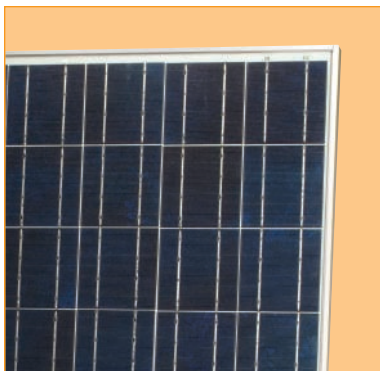
Solder-coated grid results in high fill factor performance under low light conditions.