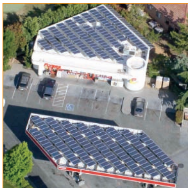
Sharp multi-purpose modules offer outstanding performance for a variety of applications.